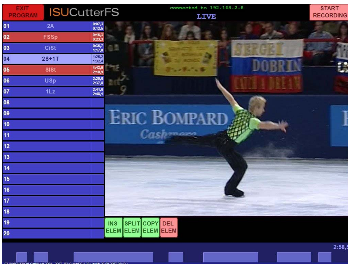
Fig. 4 Video Cutting

Switch to the cutting mode by clicking the Stop Recording button.