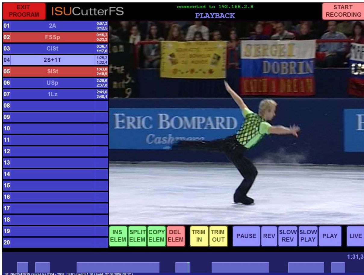
Fig. 5 Playback mode