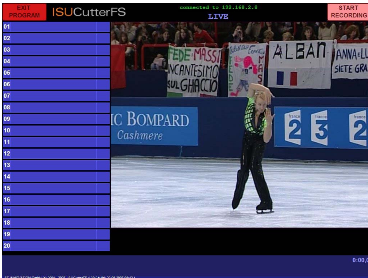
Fig. 2 ISUCutterFS Main screen

ISUCutterFS starts with the following main screen: